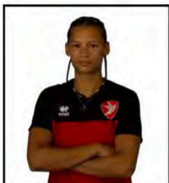
21. UNA LUE