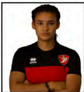
9. CLARABELLA HALL