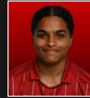
HENNA BUTCHER Available to Sponsor