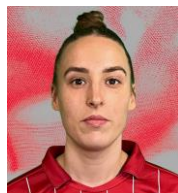
ISSY NEWS AVAILABLE TO SPONSOR