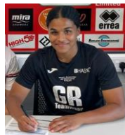
HENNA BUTCHER AVAILABLE TO SPONSOR