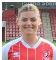
JADE GROVE AVAILABLE TO SPONSOR