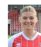
Jade GROVE SPONSOR: Holden Plant and Tool Hire