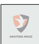
Natasha LELLIOTT Available to sponsor