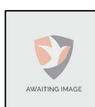
Amelie LEWIS Available to sponsor