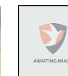
Lauren WYATT Available to sponsor