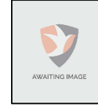
Flori DE PLANTA DE WILDENBERG Available to sponsor