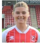
Jade GROVE SPONSOR: Holden Plant and Tool Hire