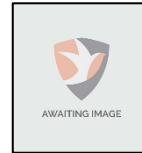
Lauren WYATT Available to sponsor