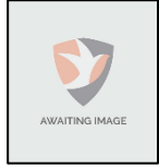
Amelie LEWIS Available to sponsor