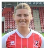
Jade GROVE SPONSOR: Holden Plant and Tool Hire