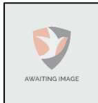
Caitlin STIRLING LEE Available to sponsor