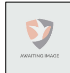
Lauren WYATT Available to sponsor