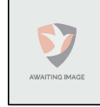
Caitlin STIRLING LEE Available to sponsor