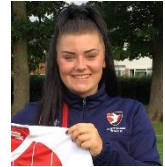
Jade Grove SPONSOR: Holden Garden Machinery